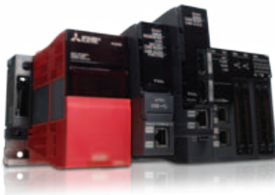
Multiple CPUs on one backplane

The iQ Platform builds on the power of Mitsubishi Electric's high performance PACs, complementing this with a broad range of control modules and network interfaces. This adaptable and powerful control platform enables companies to take a strategic approach to automation and control, allowing full integration of the plant floor operations within the business functions.